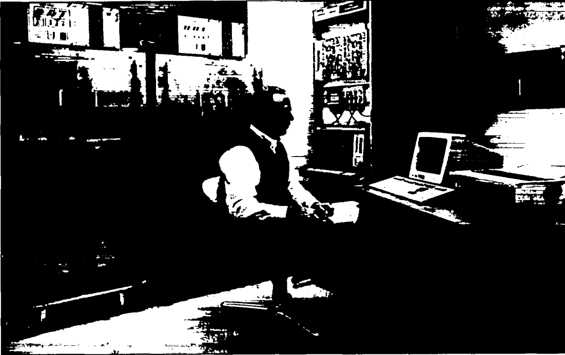
Figure 3. A FRAM system showing the scan mechanism (left), the data acquisition electronics and computer (center), and console and printer (right).